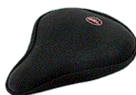
Funda de Gel